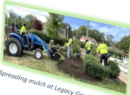
Spreading mulch at Legacy Garden Park

The 6-foot by 10-foot greenhouse at the Public Works yard has been quite useful in the preservation and cultivation of plants and flowers for future seasons. This practice also mitigates the costs and purchasing of new decorative flora each season.