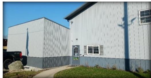
New Public Works garage addition