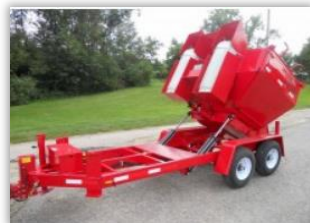
Falcon Hot Box