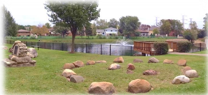
The pond at Healing Waters Park

Our crew keeps things flowing smoothly with our sanitary and storm system checks and maintenance. We've made some additional improvements to aid in preventative maintenance and to ensure smooth operations and services.