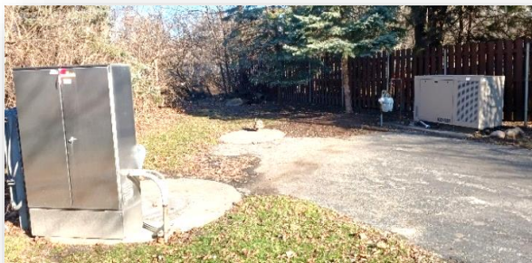
Renaissance Lift Station with new generator in background

In December, the Omni SCADA (Supervisory Control and Data Acquisition) was installed at the Fairway I lift station. The system allows for remote monitoring of the station's operation such as flow rates, pump and float information, current power draw, and more. We anticipate the system's installation at other lift stations in 2024.