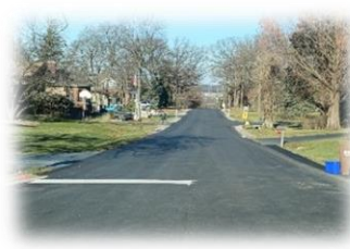
Charleton Avenue near Cedar Street

Charleton Avenue from Vinewood Avenue to 87 th Street (200-600 blocks). Road rebuild/restoration affected by the Justice-Willow Springs Water Commission water main project