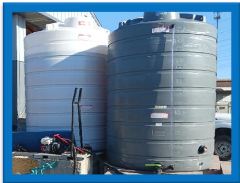
Brine storage station at Public Works

In 2024, we anticipate an upgrade to a 1,000-gallon tank sprayer system which will supplement the present 600-gallon application system.