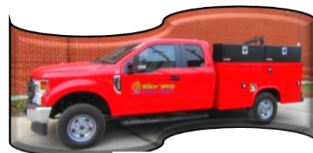
F250 Sewer & Utility Truck