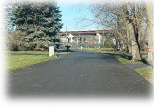
Rust Trail Area near I-294