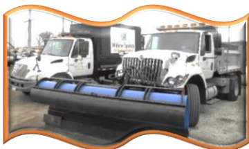
International model RT700 and 7400