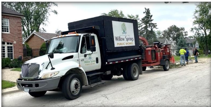
WS Public Works in Countryside, assisting with tornado cleanup.

The Public Works branch chipper is a true, all-season workhorse. We’ve made multiple, scheduled runs during the branch chipping season. Tree removal and tree and brush trimming also require chipping services. Furthermore, we have assisted the villages of Countryside and McCook during storm/tornado debris clean-up.