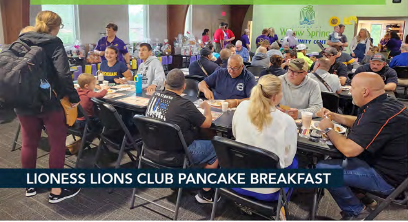
LIONESS LIONS CLUB PANCAKE BREAKFAST

The Willow Springs Lioness Lions Club held their annual Pancake Breakfast Fundraiser September 17. We had a fantastic turnout and want to thank the community and beyond for their continued support.